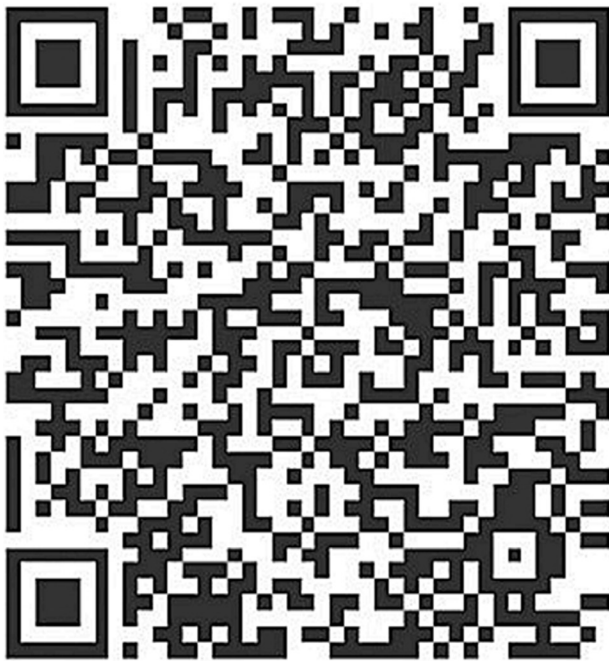
Figure 2 Application for the new mode of mobile internet-based home nursing service.

subcutaneous injection (n=32, 6.15%), general stoma care (n=10, 1.92%), psychological care (n=7, 1.35%), and intramuscular injection (n=2, 0.38%). The constituent ratios of the six major reasons to use the new mode of mobile internet-based home nursing service were 61.35%, 28.85%, 6.15%, 1.92%, 1.35%, and 0.38%, respectively (see table 2).